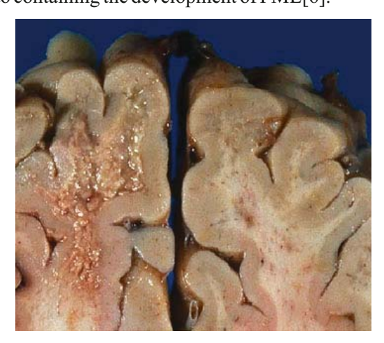
Figure 2 . Progressive multifocal leukoencephalopathy (PML): macroscopic view. [Cited 2014 May 08]. Available from http://library.med.utah.edu/WebPath/TUTORIAL/AI DS/AIDS076.html

antibodies like the ones applied for management of multiple sclerosis (MS) and Crohn's disease, led to unexpected side effects and reports for development of, or increased risk for PML[2, 3]. Potent suppression of the cellular immune system seems to be responsible for reactivation of JCV and subsequent development of PML[4]. Moreover, transfer of altered viral genomes to the CNS via infected B-lymphocytes may be facilitated even following transient cellular immunosuppression [5], and neurovirulent JCV strains may progressively affect the oligodendrocytes and astrocytes. The onset of the disease and its severity is determined by the ability of the host to initiate and maintain a robust cellular immune response against replicating JCV [6]. Various T-lymphocytes play an important part in the host defence mechanisms against viruses like JCV, such as the CD4+ type lymphocytes, which stimulate a cytotoxic immune response, mediated by CD8+T-cells [7]. Active destruction of glial cells harbouring replicating viruses involves the effect of differentiated CD8+ cytotoxic T-lymphocytes that are specific for JCV, which in turn contribute to containing the development of PML[6].